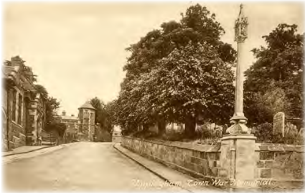
The War Memorial in its original position c1920

War memorial, c.1920. Of stone with bronze inscription panels. Cross, raised on 3 octagonal steps, with square base on 4 scrolly brackets, chamfered shaft and lantern head, finely carved with figures of the Virgin and Child, St George, St Michael and the Crucifixion.